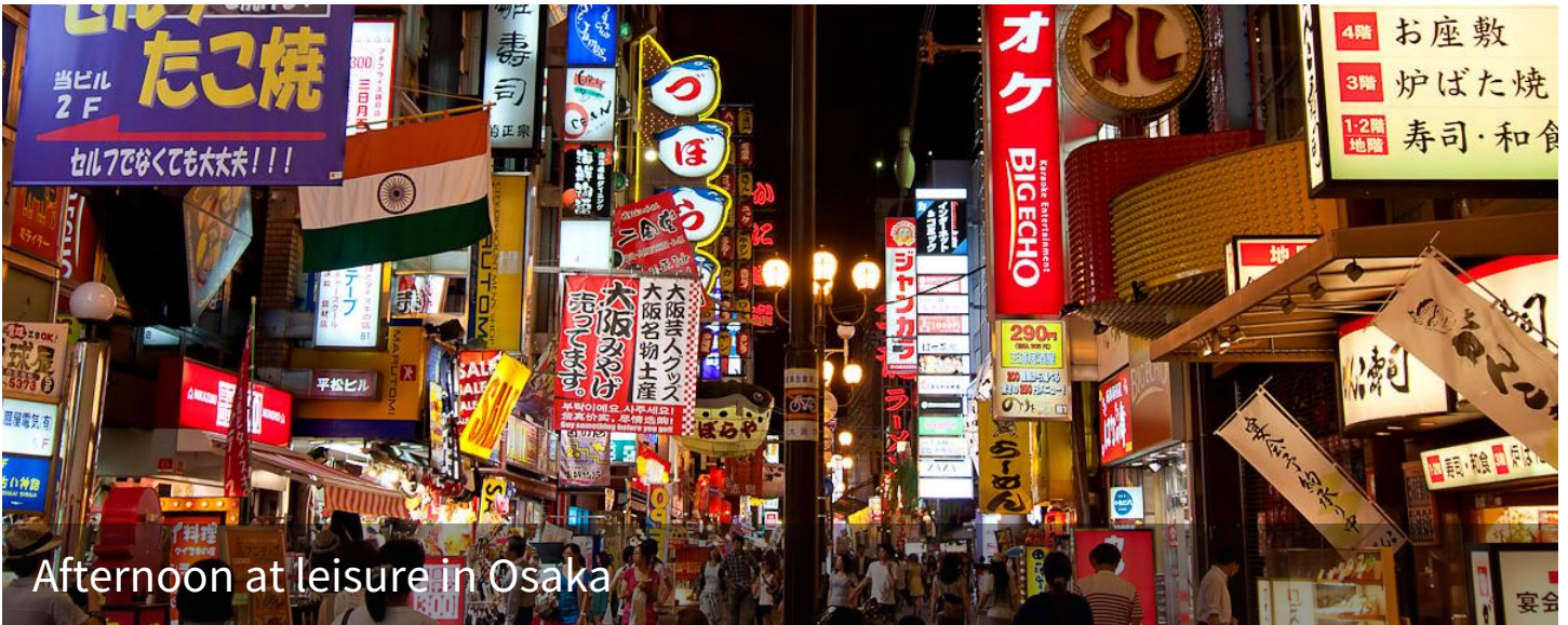
Afternoon at leisure in Osaka

Spend the afternoon exploring Osaka at leisure. We suggest strolling around the Kita area, where we recommend seeing the city from above by visiting the observatory at the Shin Umeda City Building, and below, in the underground shopping malls and arcades.