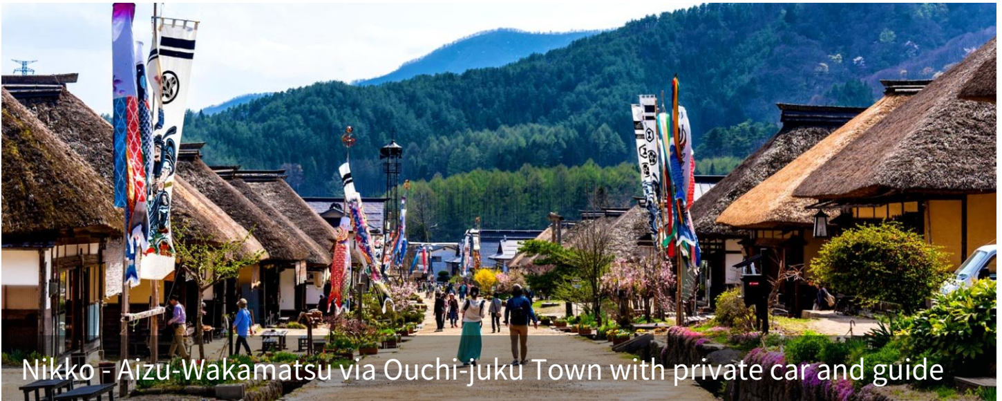
Nikko - Aizu-Wakamatsu via Ouchi-juku Town with private car and guide

This morning you will be met by your driver and guide and will be transferred to your next destination.