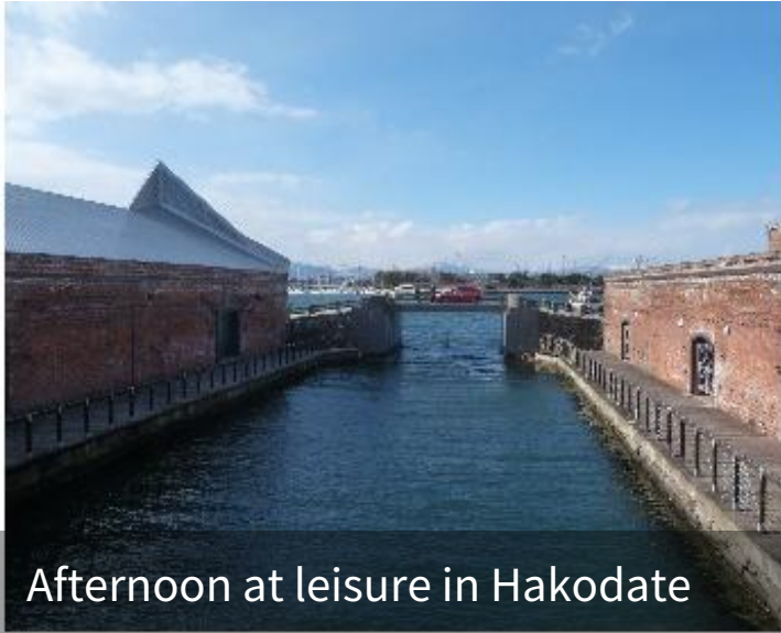
Afternoon at leisure in Hakodate