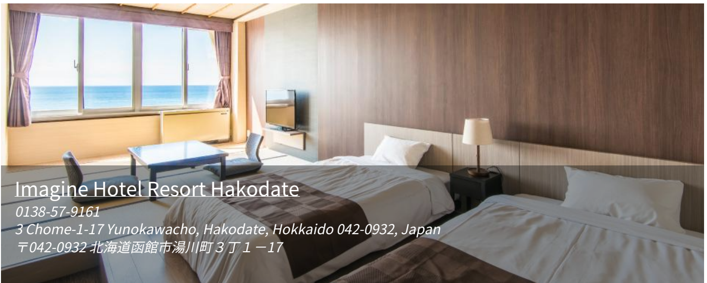
Imagine Hotel Resort Hakodate